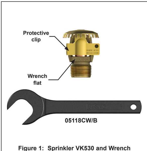
Figure 1: Sprinkler VK530 and Wrench