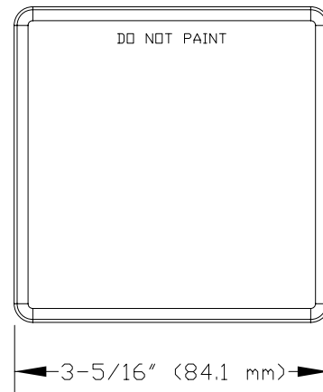
Figure 3: Square Cover Assembly 15394