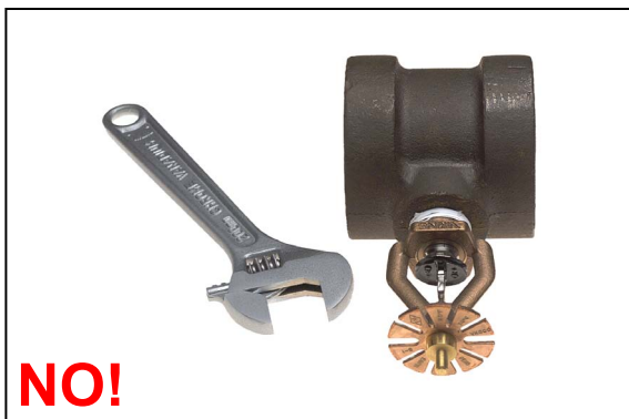
Figure 3: Incorrect installation wrench (ESFR sprinkler shown with a crescent wrench)