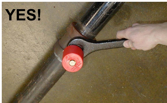
Figure 1: Correct use of designated installation wrench with ESFR Pendent K14 Sprinkler SIN VK500 and sprinkler cap

DO NOT install sprinklers onto piping at the floor level. Install sprinklers after the piping is in place at the ceiling to prevent mechanical damage.