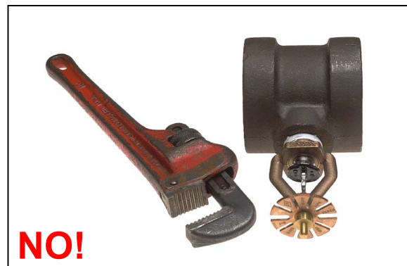
Figure 4: Incorrect installation wrench (ESFR sprinkler shown with a pipe wrench)

NOTE: The sprinklers are contained in plastic caps for protection during shipping and installation. Remove the caps from the sprinklers AFTER installation. Use care when removing the caps to prevent dislodging the ejector spring or damaging the fusible element. The caps MUST be removed from sprinklers BEFORE placing the system in service!