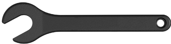
Figure 1: Sprinkler Wrench