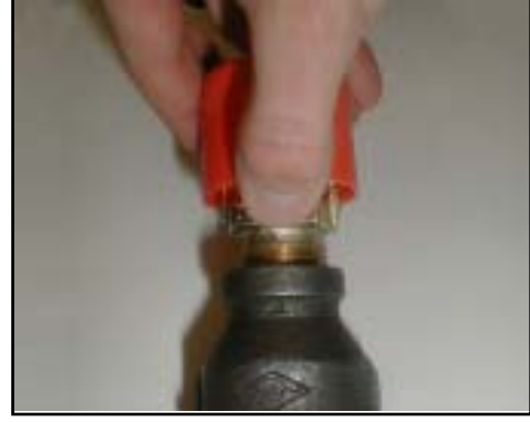
Figure 3: Sprinkler cap being removed from and upright sprinkler.