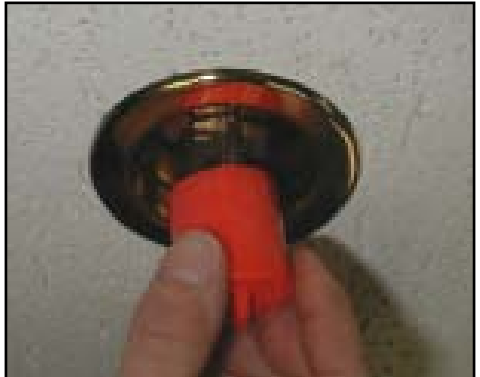
Figure 2: Sprinkler cap being removed from a pendent sprinkler.