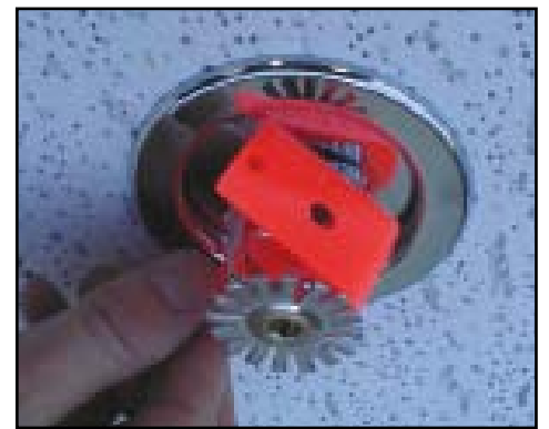
Figure 1: Sprinkler shield being removed from a pendent sprinkler.

SHIELDS AND CAPS MUST BE REMOVED FROM SPRINKLERS BEFORE PLACING THE SYSTEM IN SERVICE!