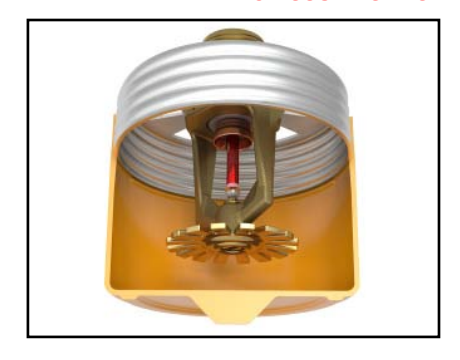
Concealed Sprinkler and Adapter Assembly with Protective Cap

ACAUTION CONCEALED COVER ASSEMBLIES ARE FRAGILE! TO ASSURE SATISFACTORY PERFORMANCE OF THE PRODUCT, HANDLE WITH CARE.