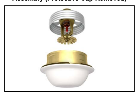
Cover Plate Assembly (Pendent Cover 12381 shown)

Concealed Sprinkler and Adapter Assembly (Protective Cap Removed)