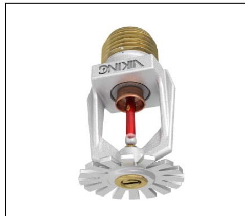
For Light Hazard Occupancies Only