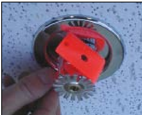
Figure 1: Sprinkler shield being removed from a pendent sprinkler.

SHIELDS AND CAPS MUST BE REMOVED FROM SPRINKLERS BEFORE PLACING THE SYSTEM IN SERVICE!