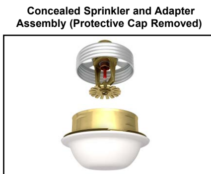
Concealed Sprinkler and Adapter Assembly (Protective Cap Removed)