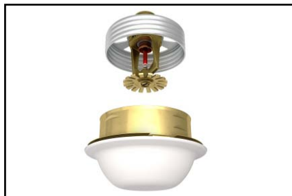
Cover Plate Assembly (Pendent Cover 12381 shown)