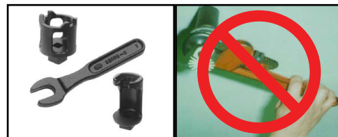
CORRECT (Special installation wrenches)