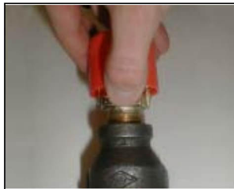
Figure 3: Sprinkler cap being removed from an upright sprinkler.