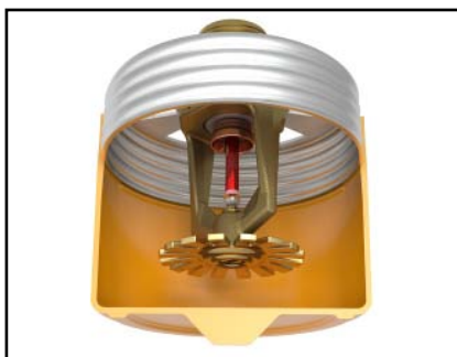
Concealed Sprinkler and Adapter Assembly with Protective Cap

CONCEALED COVER ASSEMBLIES ARE FRAGILE! TO ASSURE SATISFACTORY PERFORMANCE OF THE PRODUCT, HANDLE WITH CARE.