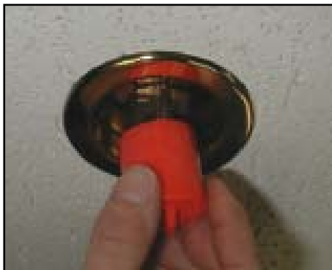
Figure 2: Sprinkler cap being removed from a pendent sprinkler.