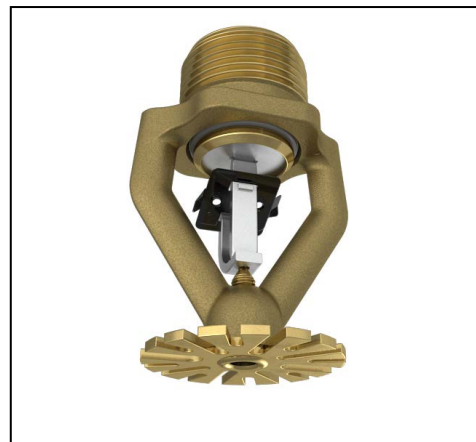
TABLE 1 SPRINKLER GENERAL INFORMATION

In addition, some storage arrangements of rolled paper, flammable liquids, aerosols, and rubber tires may be protected by Viking ESFR Pendent Sprinkler VK510.