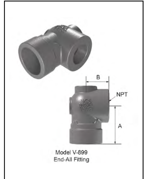
TABLE 1: VGS Model V-899 END-ALL FITTING SIZING CHART