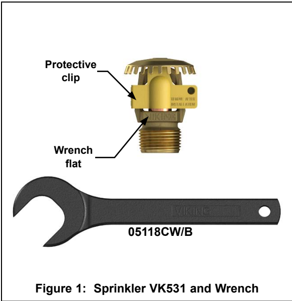
Figure 1: Sprinkler VK531 and Wrench

The Viking Corporation, 210 N Industrial Park Drive, Hastings MI 49058 Telephone: 269-945-9501 Technical Services: 877-384-5464 Fax: 269-818-1680 Email: techsvcs@vikingcorp.com Visit the Viking website for the latest edition of this technical data page.