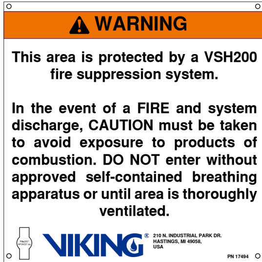
Part No. 17494: Outside Warning Sign

Viking Special Hazards | Technical Services: 877-384-5464 | Email: techsvcs@vikingcorp.com | www.vikinggroupinc.com