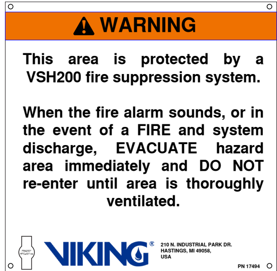
Part No. 17493: Inside Warning Sign