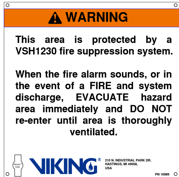
Part No. 16989: Inside Warning Sign