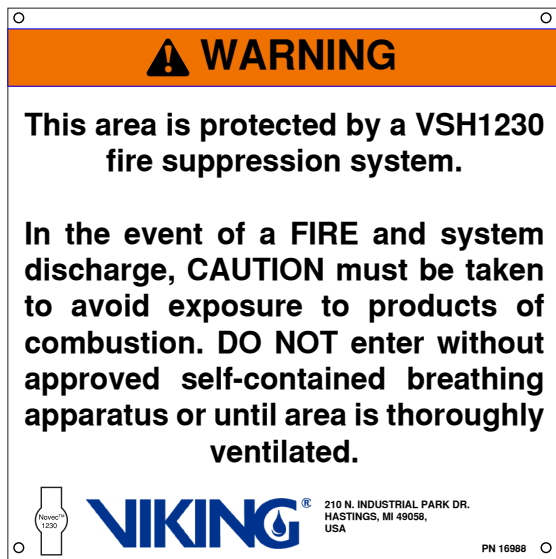
Part No. 16988: Outside Warning Sign