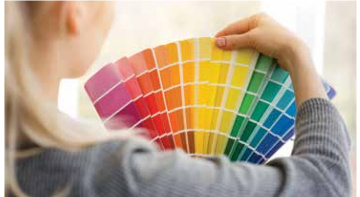
Our exclusive Colormatch® service can duplicate any paint sample or color chip, providing endless options for a beautiful, finished look.

To order custom cover plate painting, contact your Viking SupplyNet customer service representative.