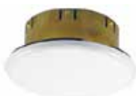
Large, Part No. 13642 3-5/16" (84mm) diameter (Part No. 16207 for VK480 and VK490)