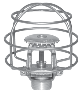
Model D-1 Sprinkler Guard on Upright and Pendent Frame-Style Sprinklers*