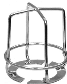
Dry Sprinkler Guard (Order sprinkler guard separately from sprinklers.)