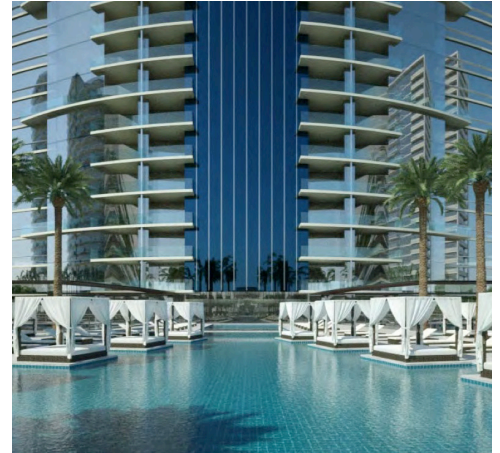
Viking CPVC Sprinkler Piping and Freedom® Residential Sprinklers provide the ultimate in residential high-rise protection.