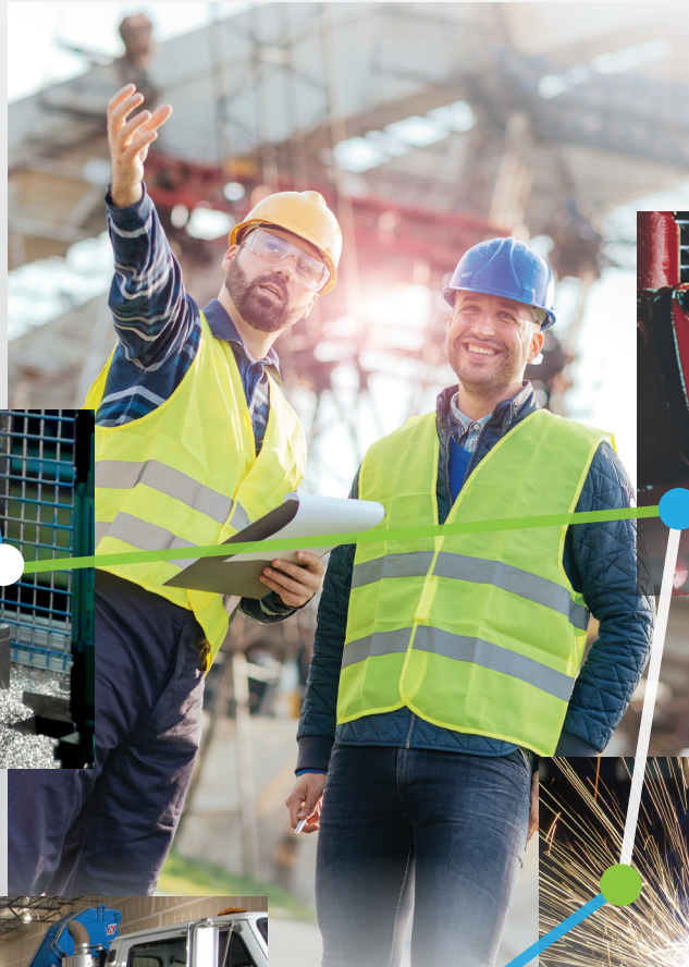
WAREHOUSING / DISTRIBUTION