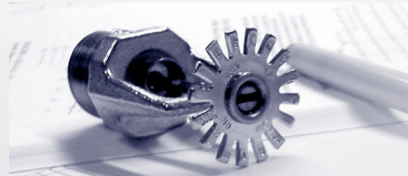
DESIGN, ENGINEERING, AND TESTING

Viking is the only 100% vertically integrated sprinkler systems manufacturer, fabricator, and distributor in the United States. We understand the importance of CPVC material compatibility, and product dependability is a major focus for everyone in the Viking supply chain. From the drawing board to the job site, trust Viking for quality and efficiency at every step.