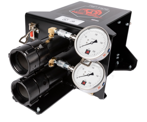
<u>DOUBLE ACTION RIPTIDE</u>™ MSRP: $2500