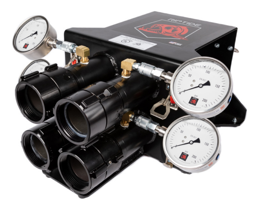
<u>QUAD ACTION RIPTIDE</u>™ MSRP: $4400

<u>TRIPLE ACTION RIPTIDE</u>™ MSRP: $3500