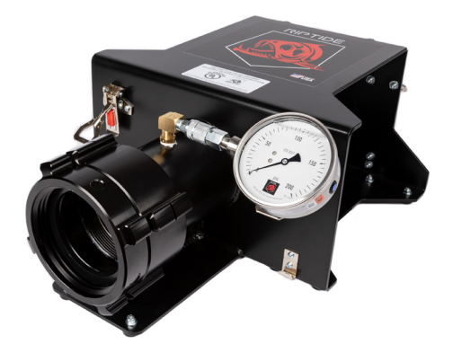
<u>LDH 4" RIPTIDE</u>™ MSRP: $1400