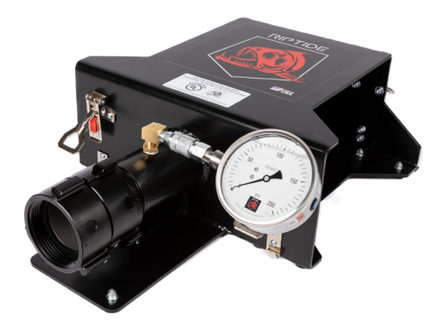
<u>SINGLE ACTION RIPTIDE</u>™ MSRP: $1400

AS TO FLOW MEASUREMENT ACCURACY SPECIFIED BY THE MANUFACTURER WHEN INSTALLE IN ACCORDANCE WITH THE MANUFACTURERS INSTALLATION INSTRUCTIONS