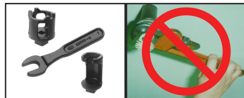
CORRECT (Special installation wrenches)