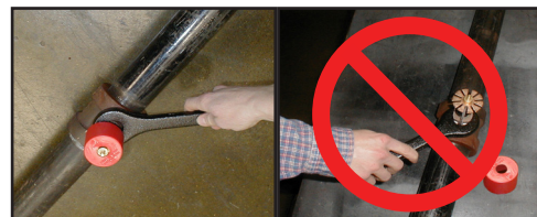
CORRECT (Piping is in place at the ceiling)