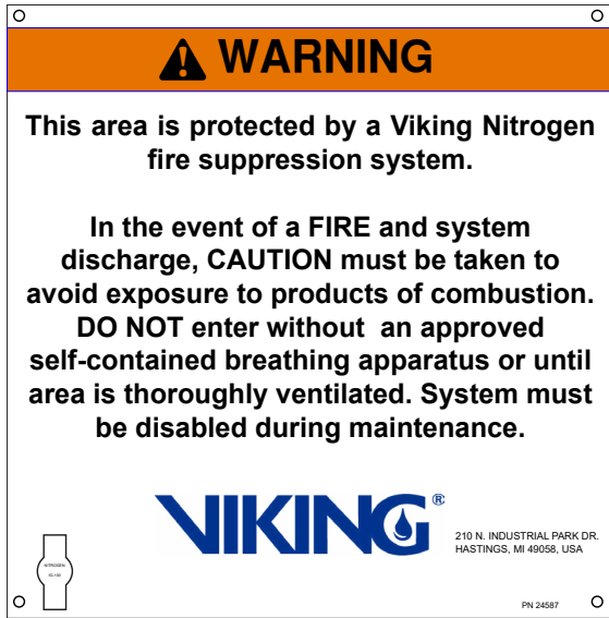
Part No. 24587: Outside Warning Sign

The Viking Corporation | 210 N Industrial Park Drive | Hastings MI 49058 Viking Special Hazards | Technical Services: 877-384-5464 | Email: techsvcs@vikingcorp.com | www.vikinggroupinc.com The technical data described herein is for components of the Viking Oxeo PR Fire Suppression Systems. Visit the Viking website for the latest edition of the technical data and system manuals.