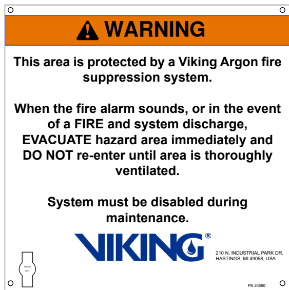
Part No. 24590: Inside Warning Sign