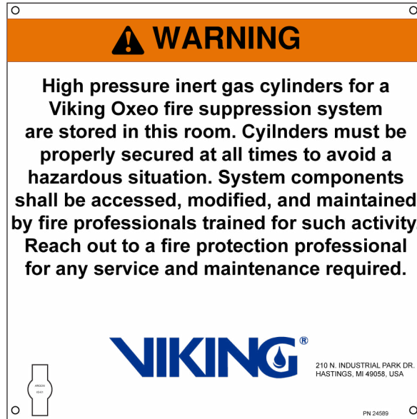
Part No. 26407: Cylinder Storage Warning Sign

Visit the Viking website for the latest edition of the technical data and system manuals.