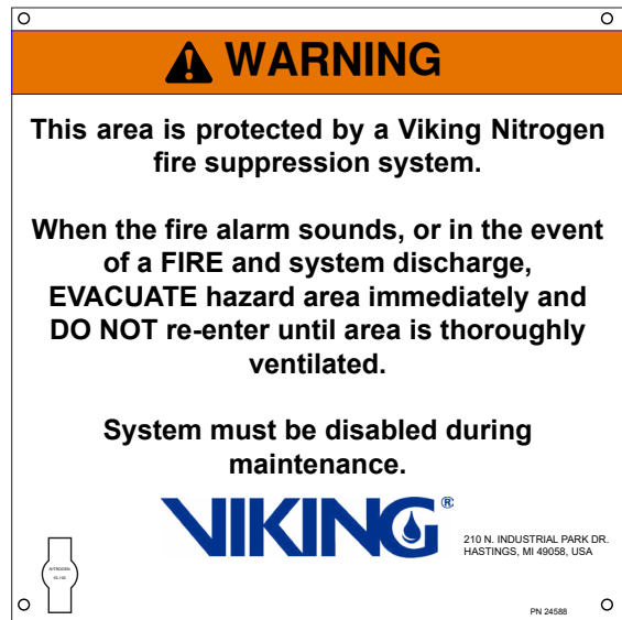
Part No. 24588: Inside Warning Sign