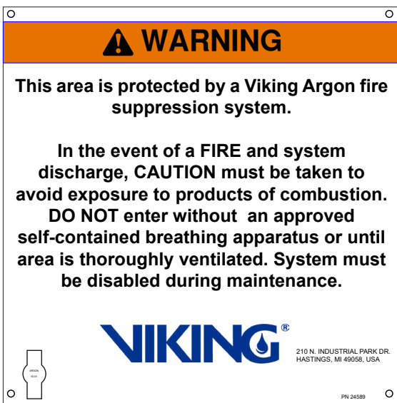
Part No. 24589: Outside Warning Sign